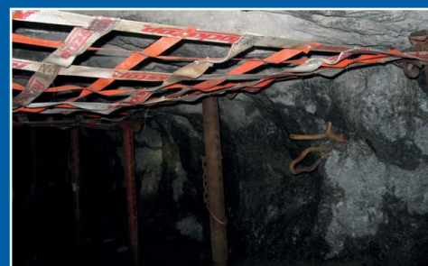
Rockstop provides support right up to the working face