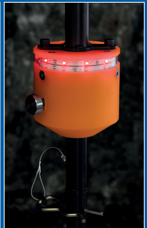
Green flashing LED lights indicate a safe working environment Red flashing LED lights indicate separation in the strata above

D6584 Doc: BR008 Rev: 02 Patents Apply ©New Concept Mining 2018